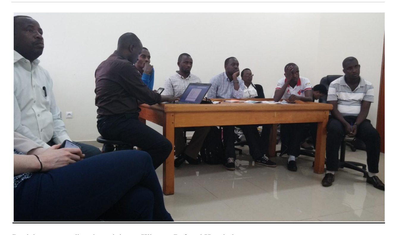
Participants attending the training at Kibungo Referral Hospital