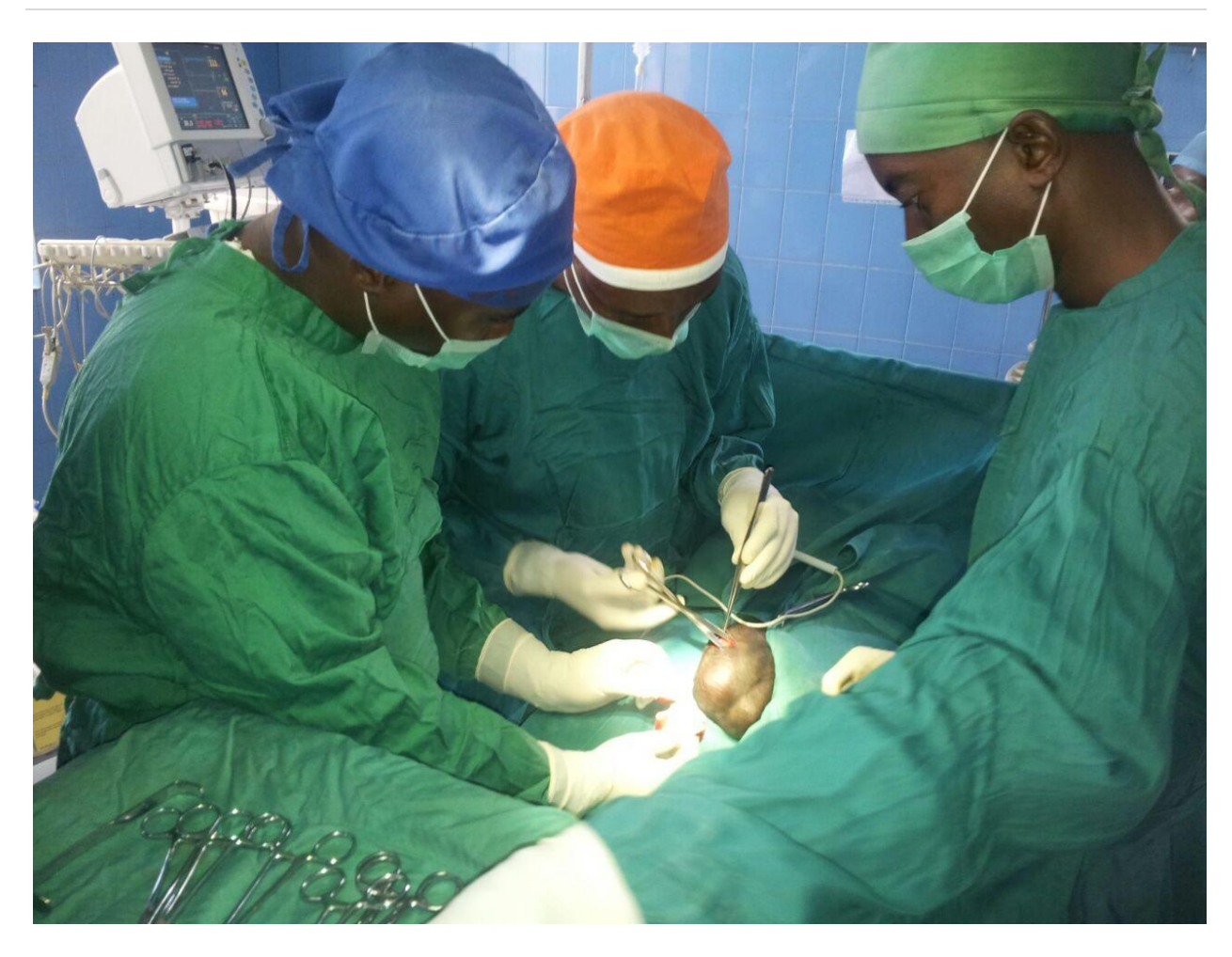
A hernias operation at Kibungo Hospital