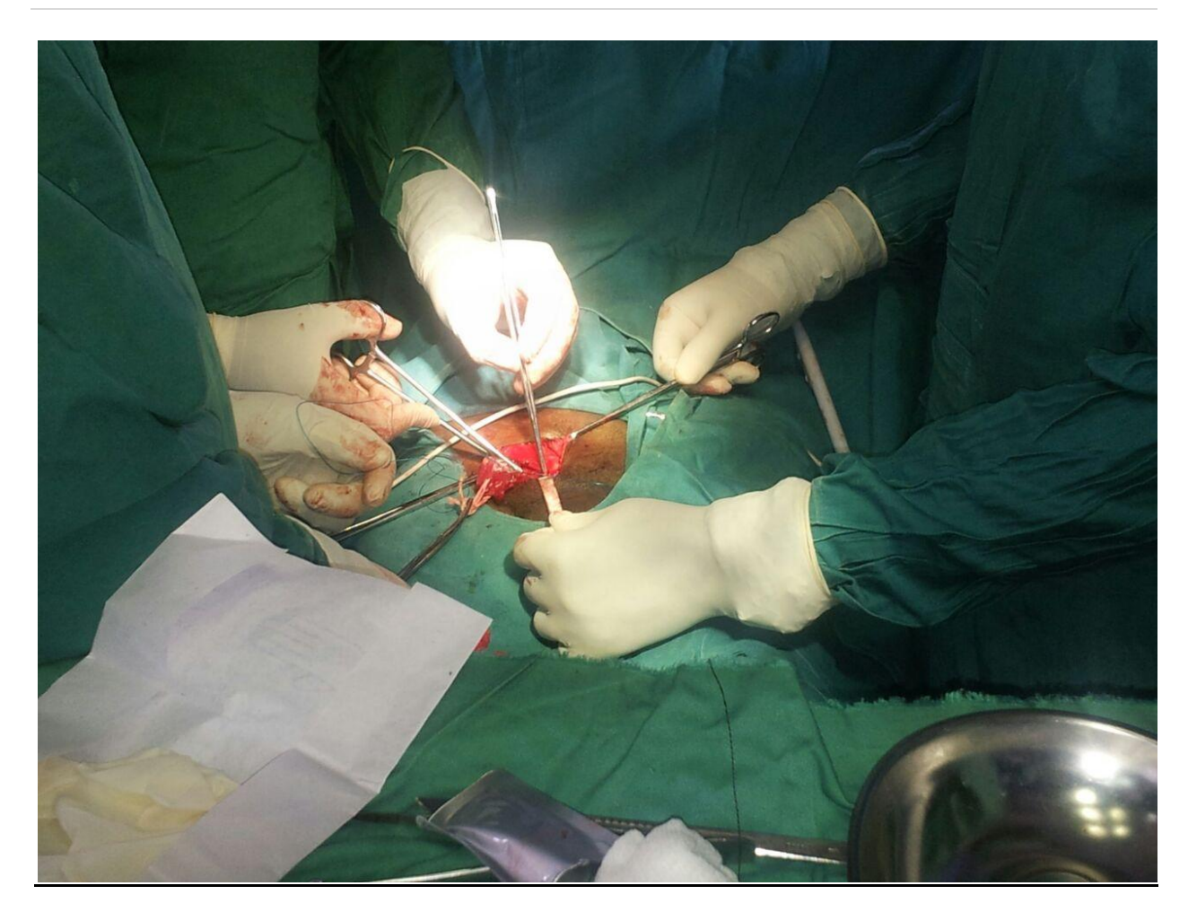
One of the operations during the Essential Surgery Training at Kibungo Referral Hospital