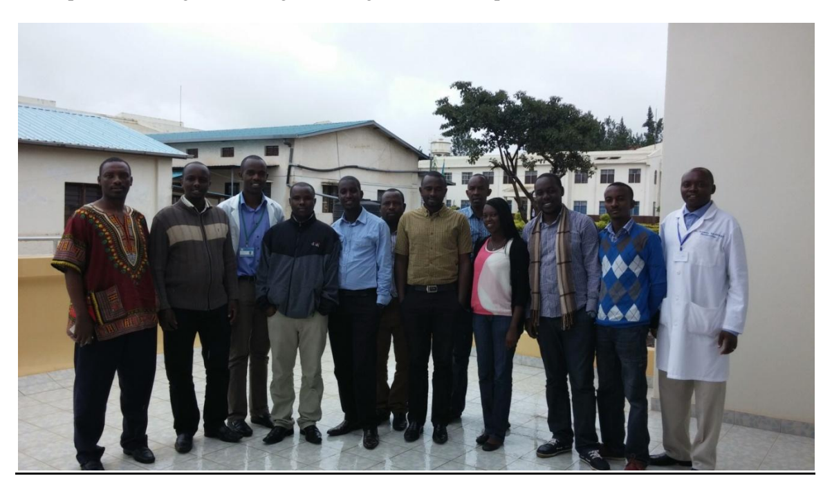
A group photo of the trainees/participants and the trainers during the Essential Surgery Training at Kibungo Referral Hospital