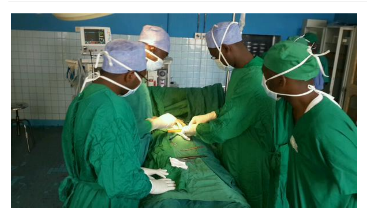
A senior resident is demonstrating the principles of the repair of a congenital indirect hernia in an adult patient