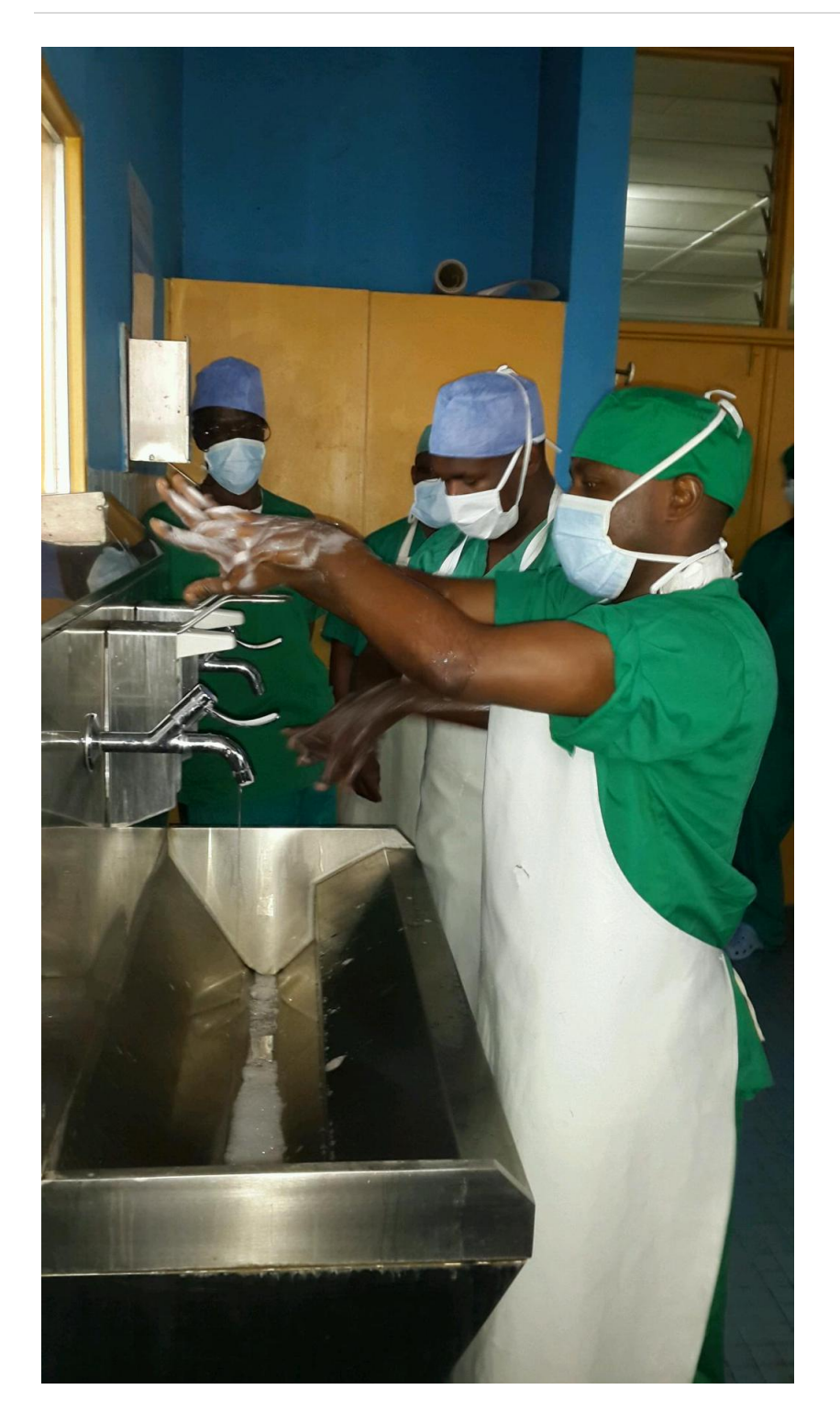
Theatre nurse demonstrating good scrubbing practice to district hospital medical officers in Ruhengeri Hospital