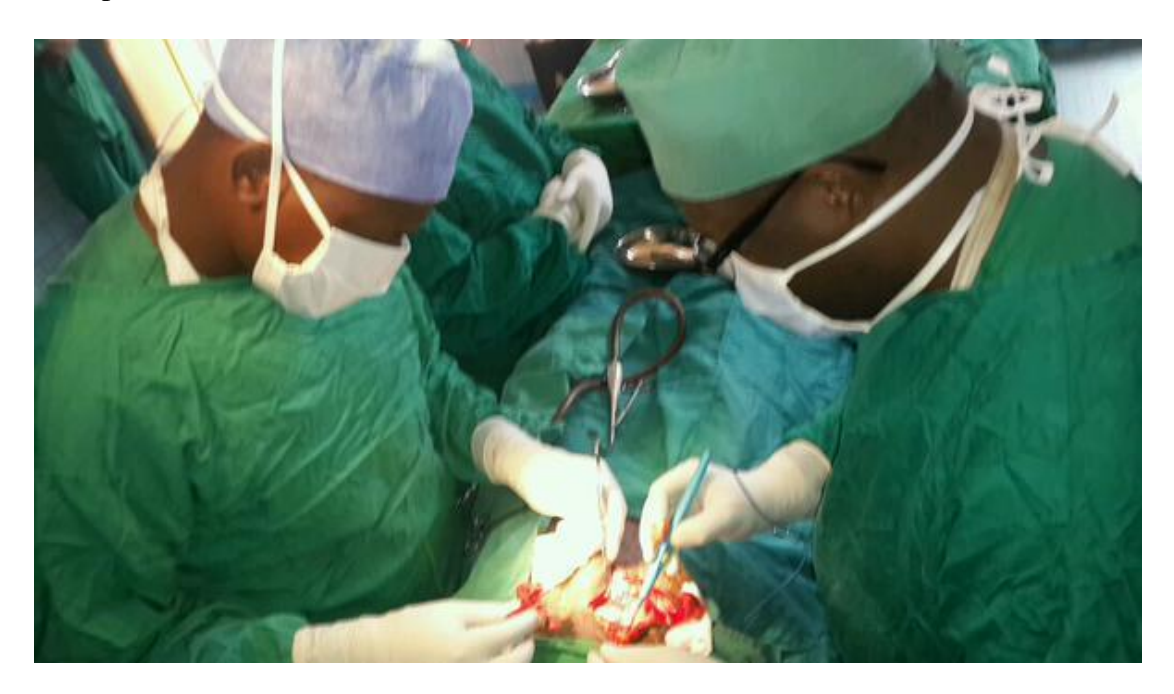
A senior surgeon assisting the local surgeon to repair a referred complicated right colon postoperative fistula.