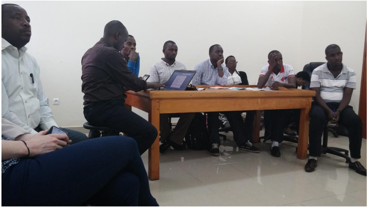
Participants attending the training at Kibungo Referral Hospital