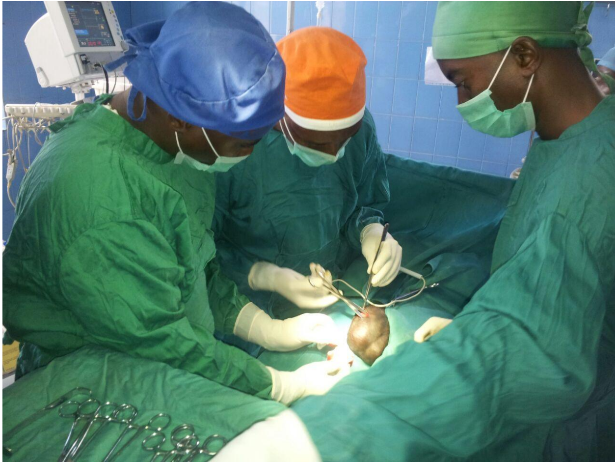
A hernias operation at Kibungo Hospital