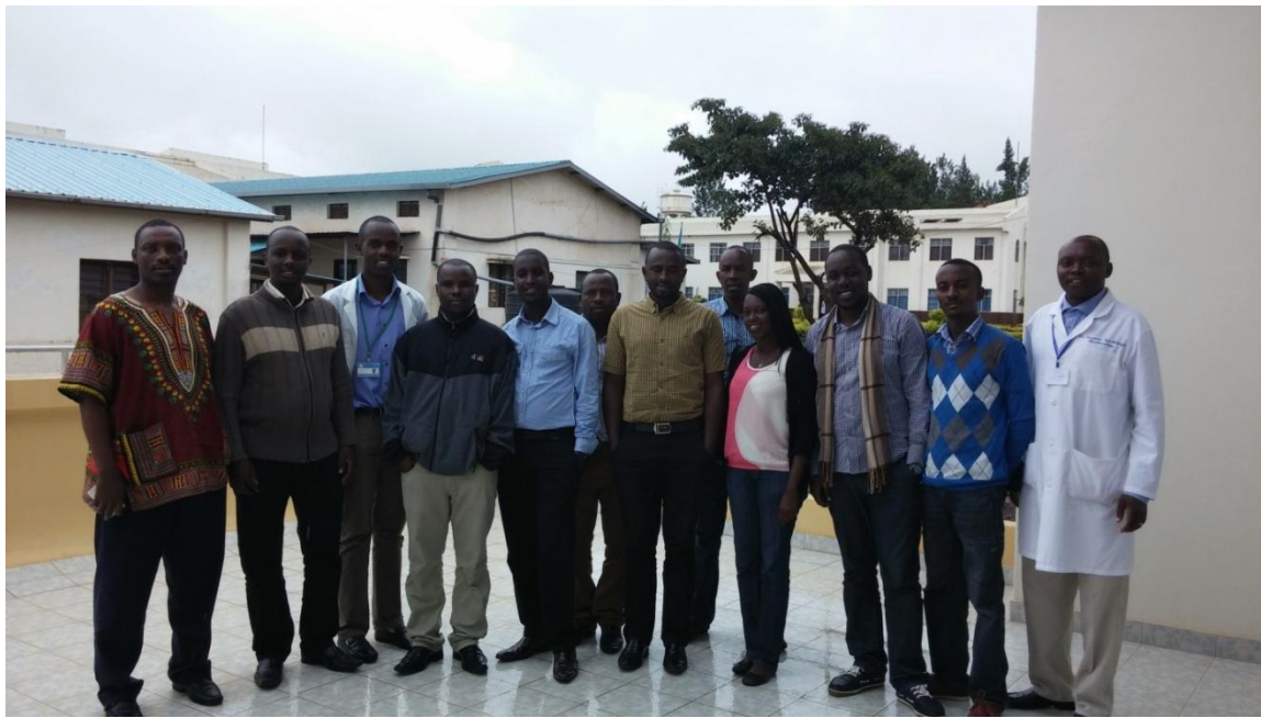
A group photo of the trainees/participants and the trainers during the Essential Surgery Training at Kibungo Referral Hospital