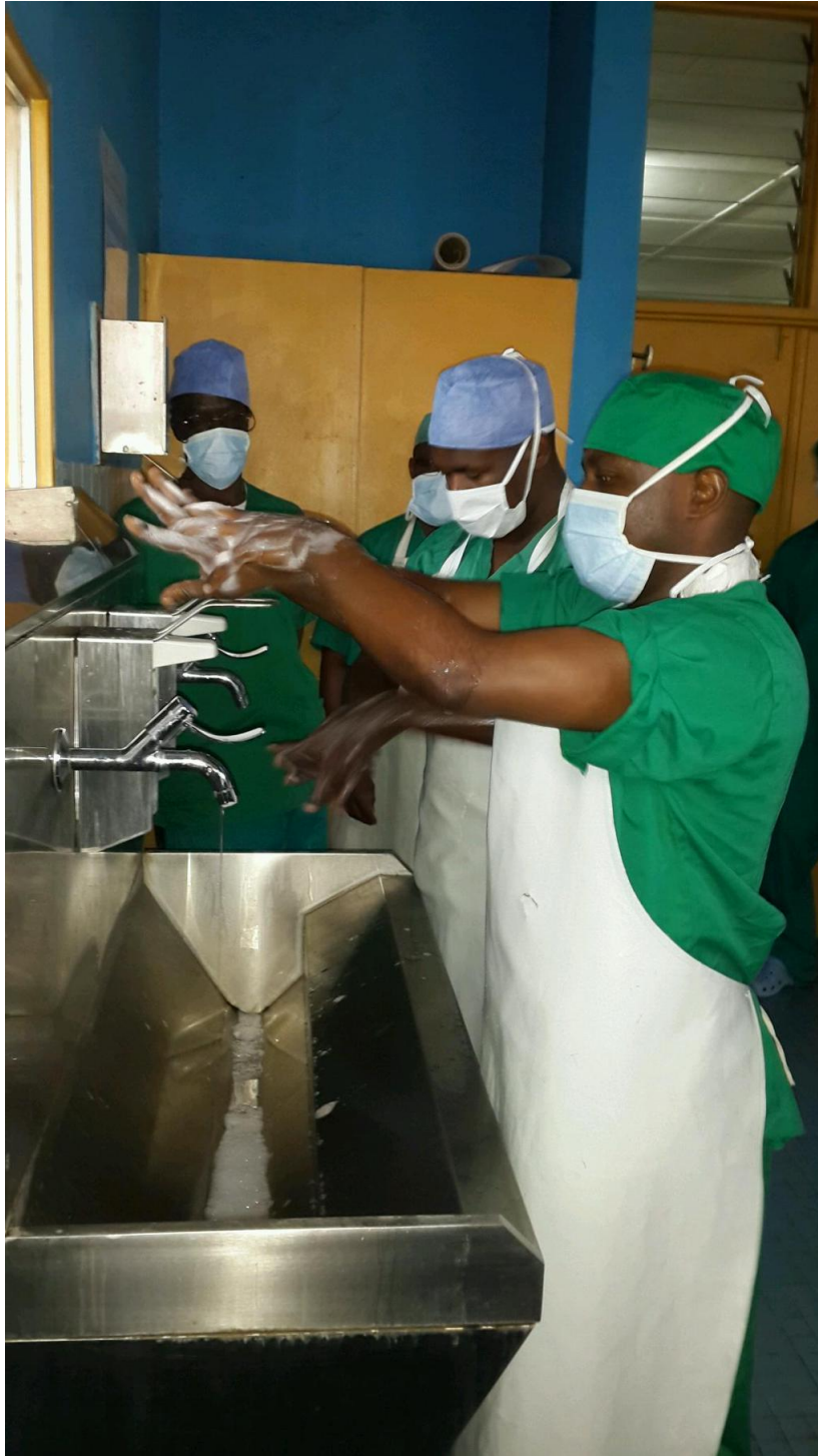
Theatre nurse demonstrating good scrubbing practice to district hospital medical officers in Ruhengeri Hospital