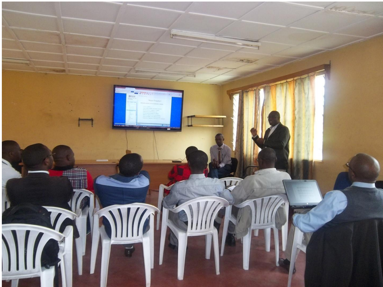
Trainees attending the EST training course at Ruhengeri Referral Hospital in Musanze District