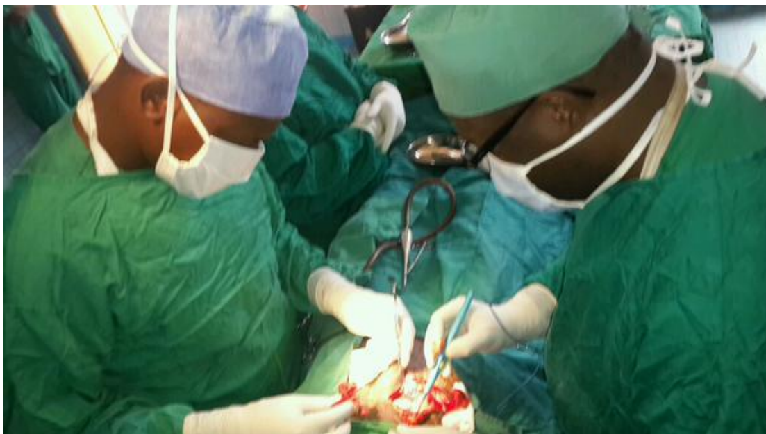
A senior surgeon assisting the local surgeon to repair a referred complicated right colon postoperative fistula.