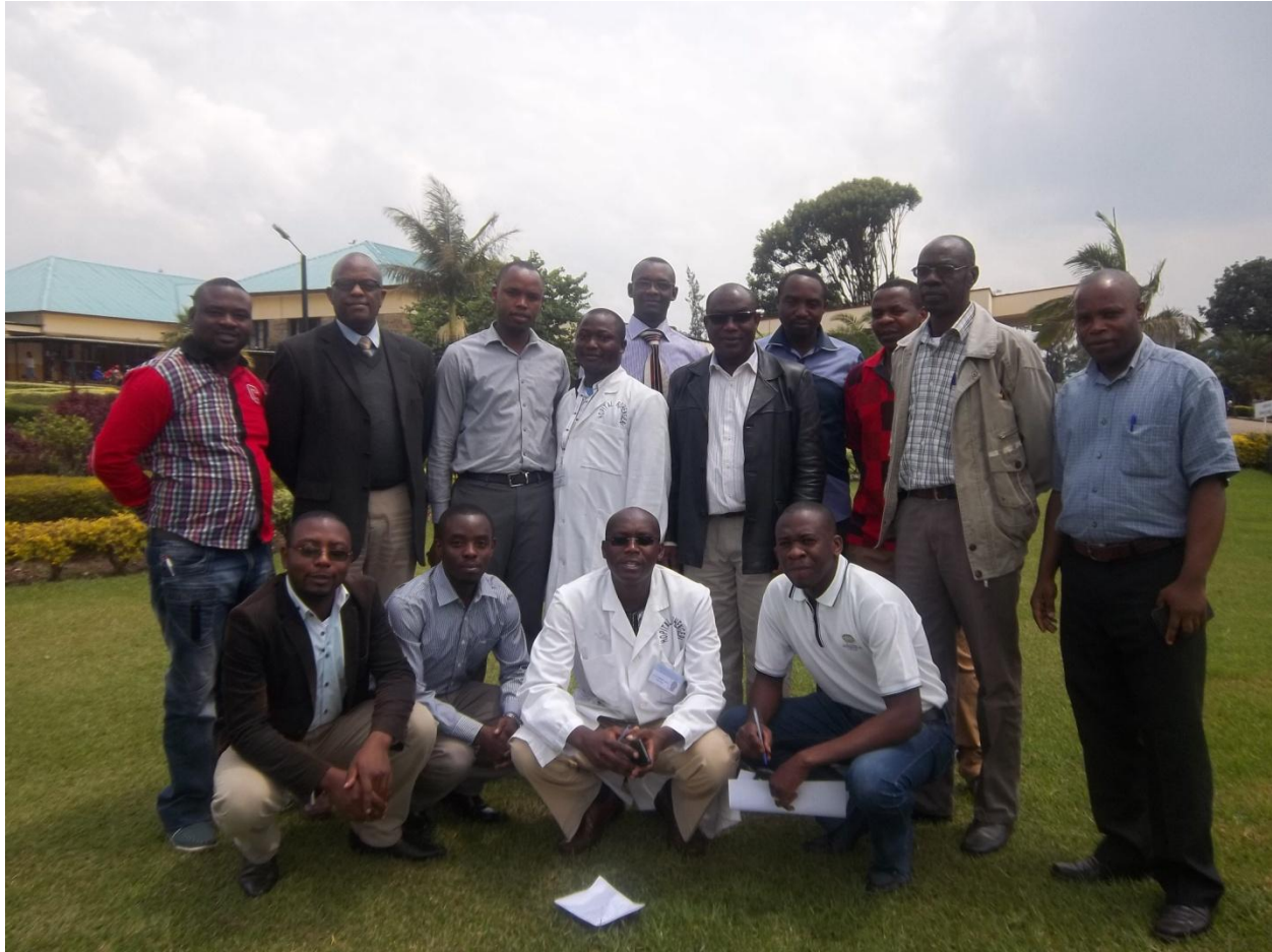
Group photo of the Trainees and Trainers at Musanze during the launch and EST training in February 2015