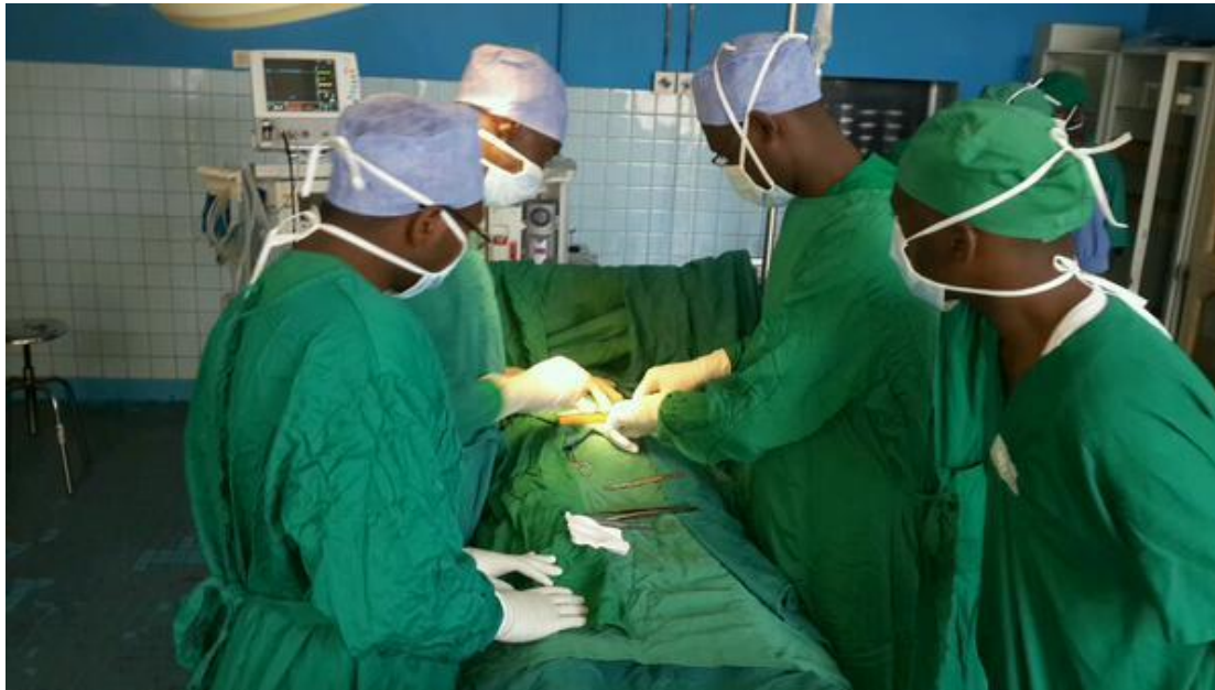
A senior resident is demonstrating the principles of the repair of a congenital indirect hernia in an adult patient